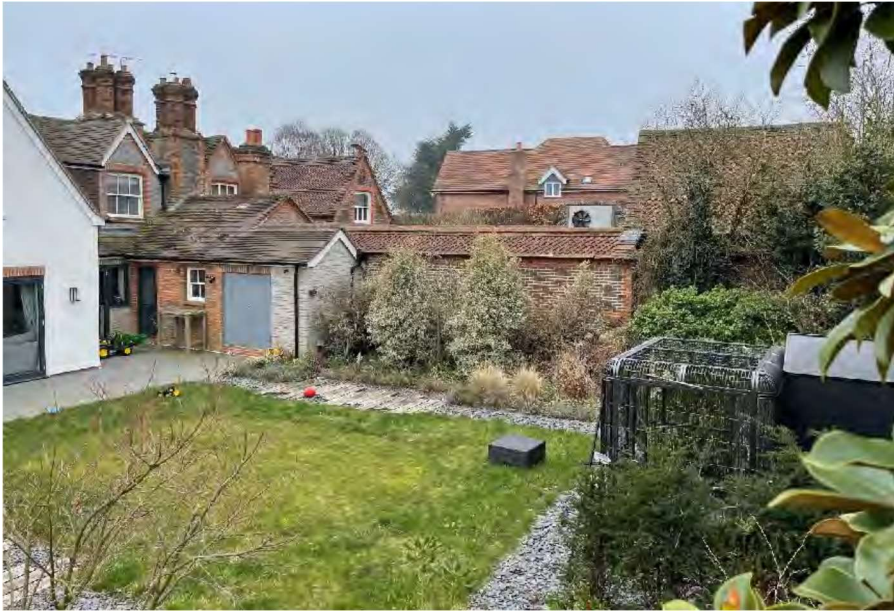
View of application site from corner of garden towards house and neighbouring property including garden (looking south)