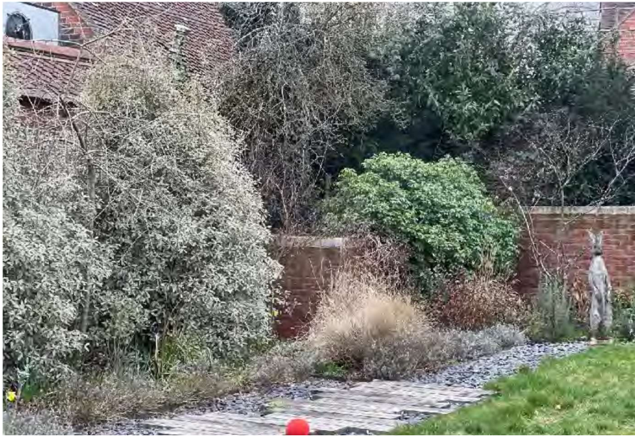
View of application site from rear garden to corner of garden showing retaining wall (looking north-west)