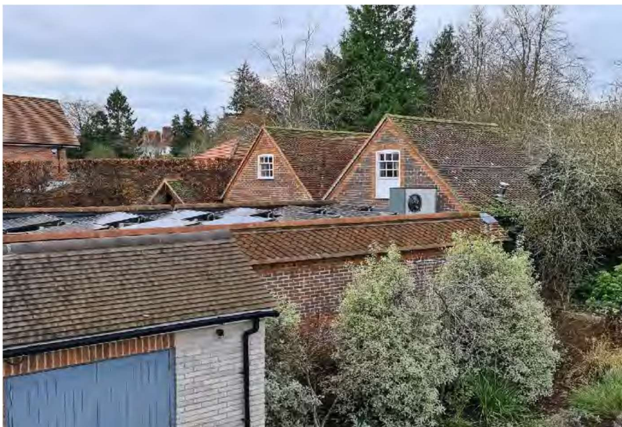
View of application site from rear garden to neighbouring building (looking north-west)