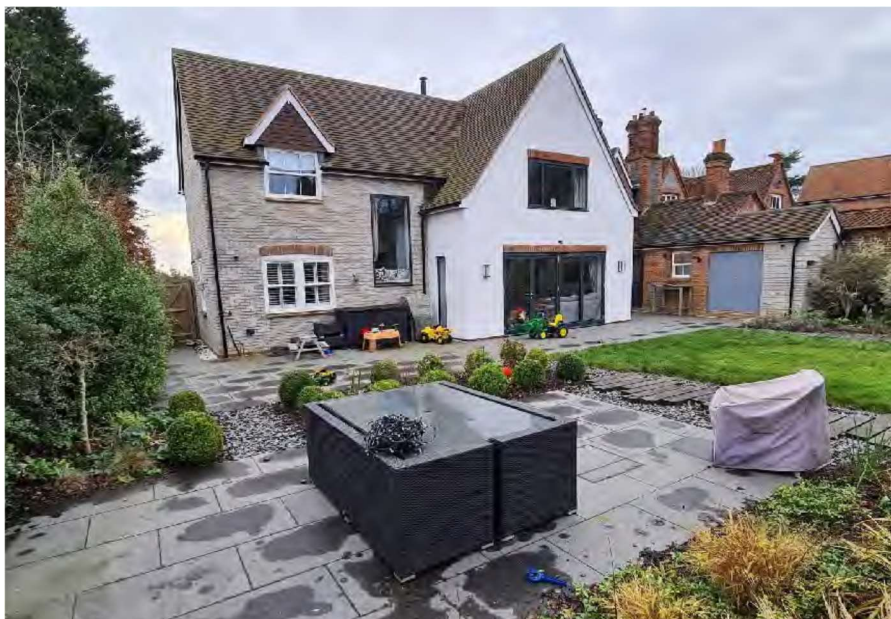
View of application site from rear garden (looking south)

Photographs for Eastern Area Planning Committee Application 21/00236/HOUSE