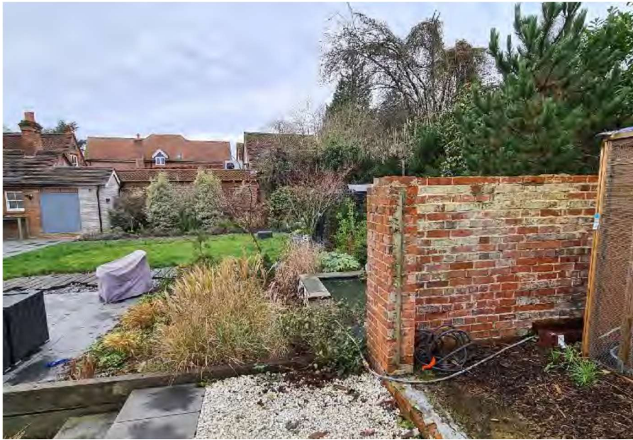
View of application site from rear garden towards neighbour (looking south-west)