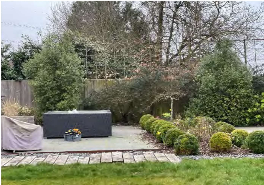
View of application site from are of proposed extension to show garden and boundary (looking north-east)